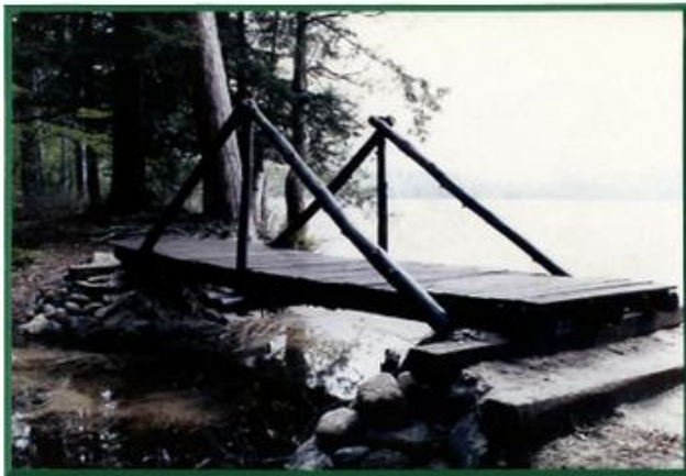
WILDERNESS PATROL RESTORATION 1989