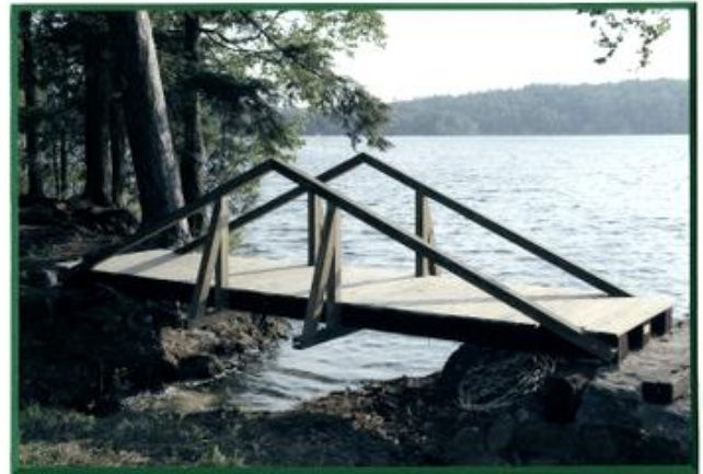
OLD-TIMERS' RECONSTRUCTION 2004