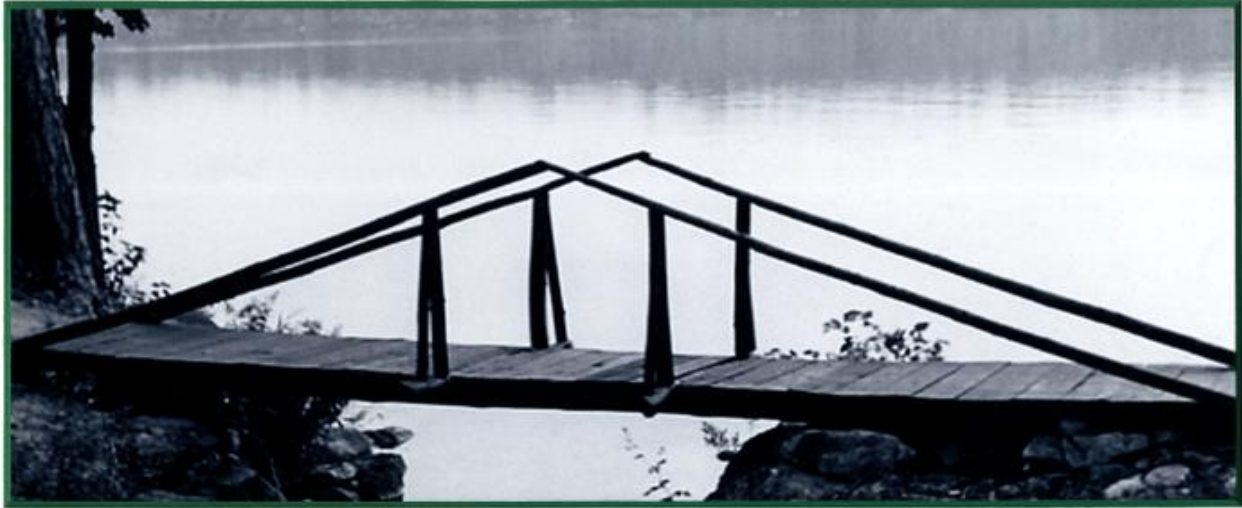
CHARLIE HORNER'S ORIGINAL BRIDGE